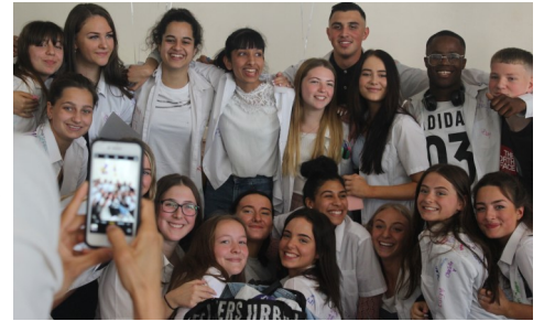
Class of 2019 enjoying their leavers' assembly

We'll be analysing the detailed results and working with Mrs Gale to update the College continuous improvement plan at our next meeting.