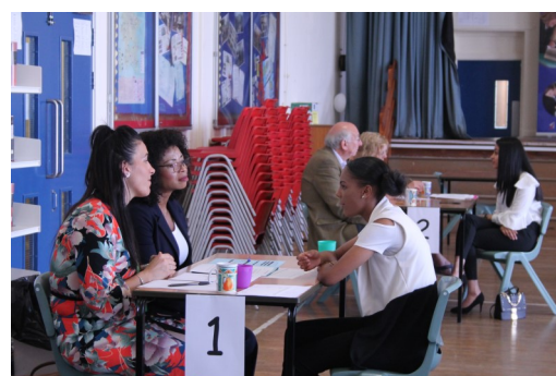
We received fantastic feedback from students & local businesses on our Mock Interview Day